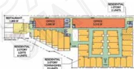
2ND FLOOR PLAN VIEW OFFICE/RESIDENTIAL