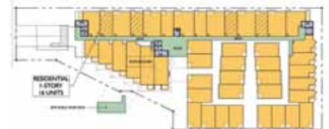
3RD FLOOR PLAN VIEW RESIDENTIAL